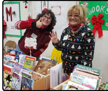
School librarians help us choose current books that interest our children and teens.