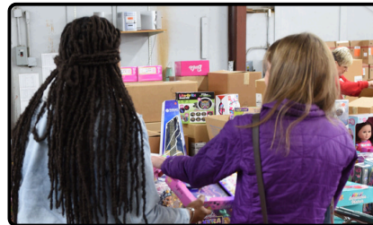
Our toy committee volunteers shop year-round so parents can find the perfect toy for their child.